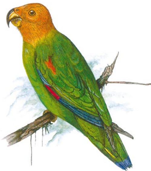
FIG. 1. Holotype of Pionopsitta aurantiocephala (MZUSP 75188) showing overall pattern of plumage and main diagnostic characteristics of the taxon. (Drawing by Frederico Lencioni.)

Holotype. Pionopsitta aurantiocephala sp. nov. MZUSP 75188 (Fig. 1). Skin; adult female with completely ossified skull; moulted feathers on head ("bristles"), lower and upper wing coverts, neck, flank, and breast; accumulated fatty tissue; carcass preserved in ethyl alcohol 70% v/v. Specimen collected by R.G.-L. and M.A.R. on 26 November 1999, on the left bank of the Cururu-açu River (08°55'N, 056°40'W), in the municipality of Jacareacanga, Pará, Brazil.