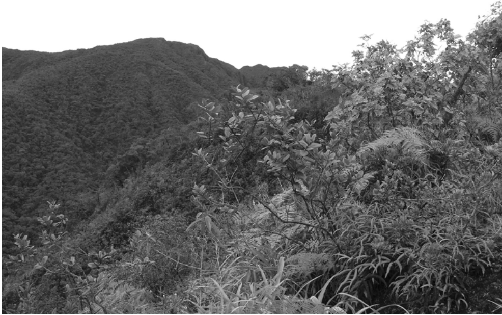
FIG. 1. Typical habitat in the Serranía del Pinche, Colombia, where Eriocnemis isabellae , sp. nov. was located.

exceeded by the smallest genus members, E. mirabilis and E. alinae (Table 1). As a tendency, the values for two females (no specimens available) suggest a similar pattern, with shorter wings and rectrices than in males.